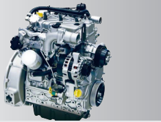
Euro V Doosan engine